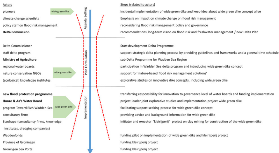
Figure 3. Steps toward implementation of the wide green dike in the Dutch flood risk management strategy (blue arrow) and main actors (key actors are in bold) based on the Hourglass Framework applied to long-term strategic delta planning (red dashed lines).

additional funding provided by the water board, to become available through guaranteed purchases of the clay produced.